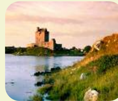
Dungaire Castle, Kinvara.

The weekend will be jam-packed with traditional hurling activities suitable for all ages, from beginner to hurling expert. Along with that, there will be plenty of music, with Kinvara long been a Mecca for musicians, and also keep a look out for some unusual characters! You can find more information at www.kinvara.galway.gaa.ie