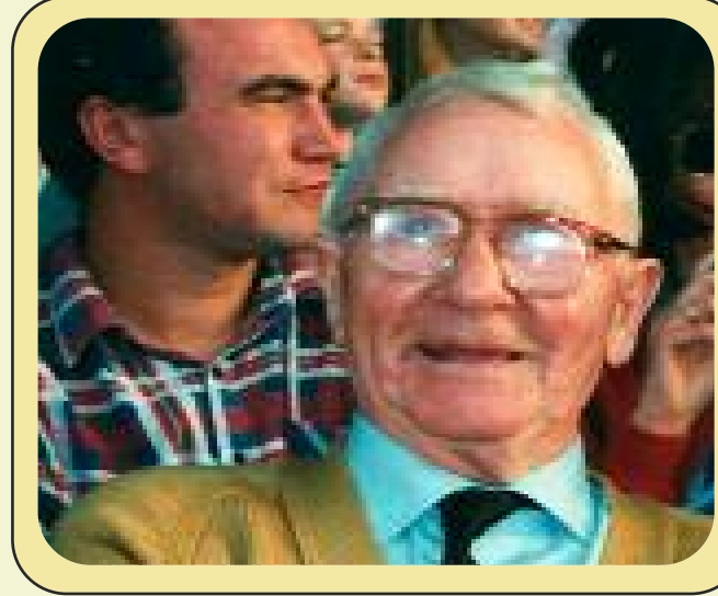
Jimmy Butler Coffey