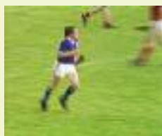
English Goal B