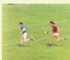
Fox Goal C