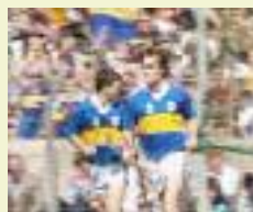
English Goal A