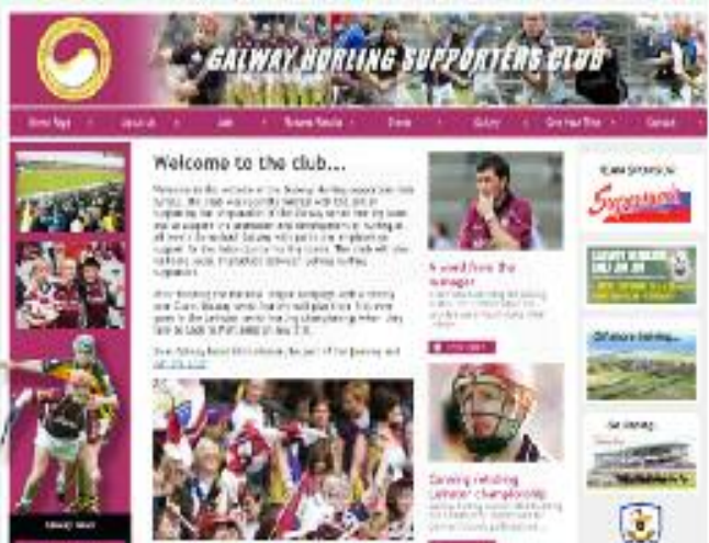
Above: The home page of the new Galway Supporters Club Website. www.ghsc.ie