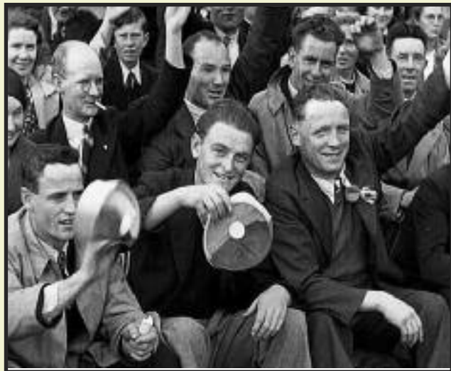
Happy supporters at the 1937 All Ireland Hurling Final in Killarney.