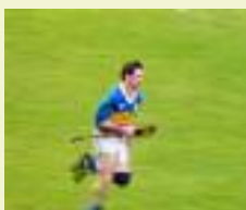
Fox Goal B