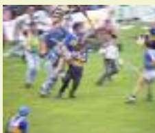
Fox Goal A