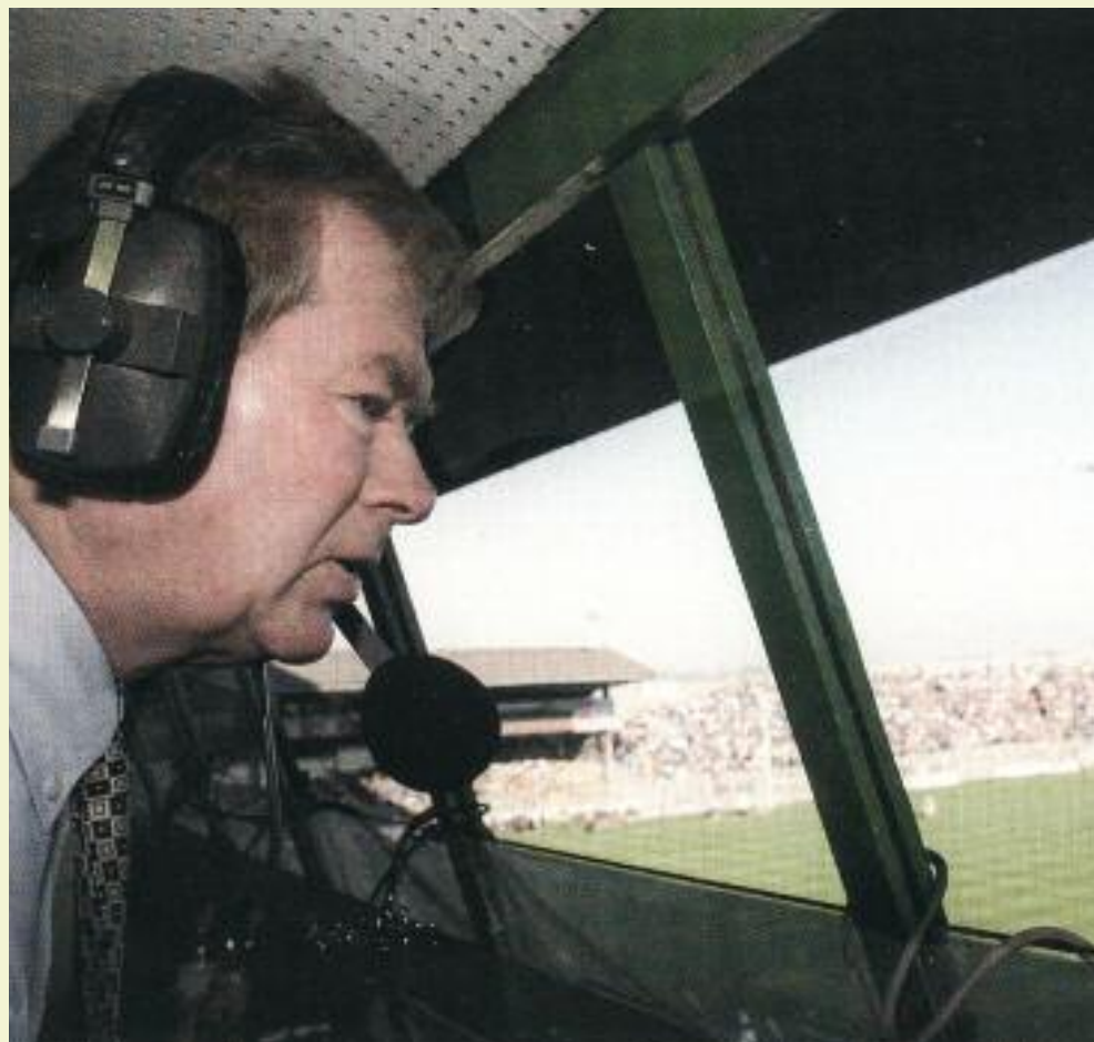
Micheal O’Muircheartaigh in Croke Park

Highlights of the launch of the new Galway Supporters Club Website in the Clayton Hotel are available on YouTube. Search for Galway Hurling Supporters Club HURL0011