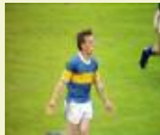
English Goal C