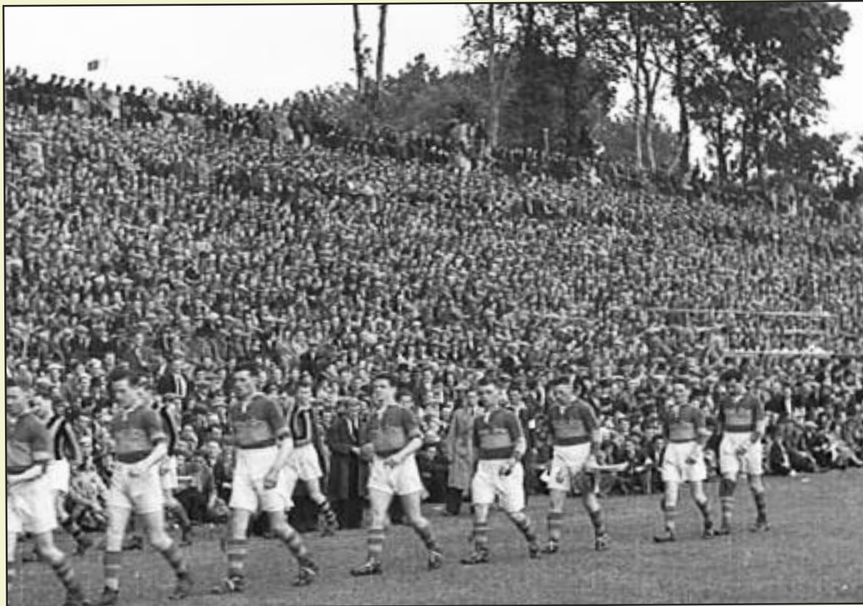
Above: The teams parade in The All Ireland Final in Killarney in 1937.