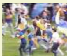
English goal D