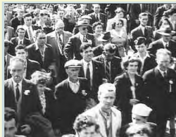
Above: The crowd arriving for the 1955 All Ireland Hurling Final.

Hurling World, Knockdoebeg East, Claregalway, Co Galway. At 15 euro including p&p.