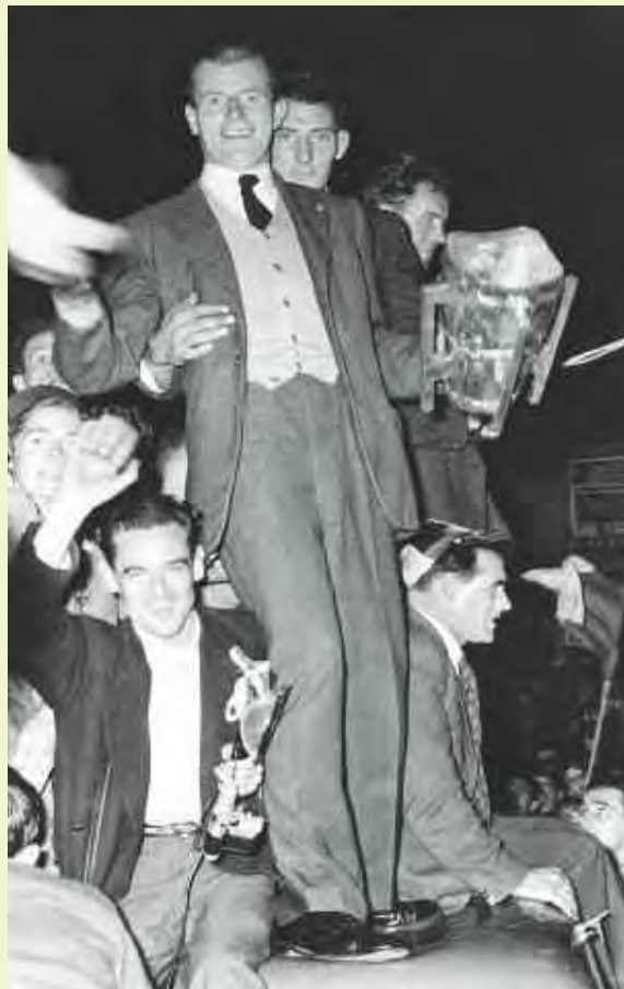
Nicky Rackard with the McCarthy Cup in Wexford in 1955.