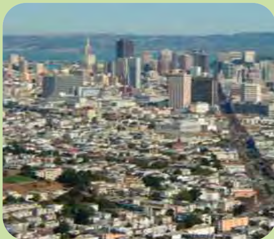
Downtown San Francisco