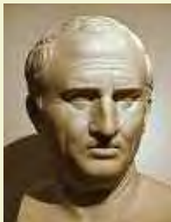
Marcus Tullius Cicero 106 BC - 43 BC

The value of sport has long been appreciated by versatile minds. Writings show that the "Ball and stick" ( clavem et pilam ) were recommended by Cicero to the youth of ancient Rome in the first century BC Magistrates sponsored games (Ludi) before elections with free admission to help get elected..