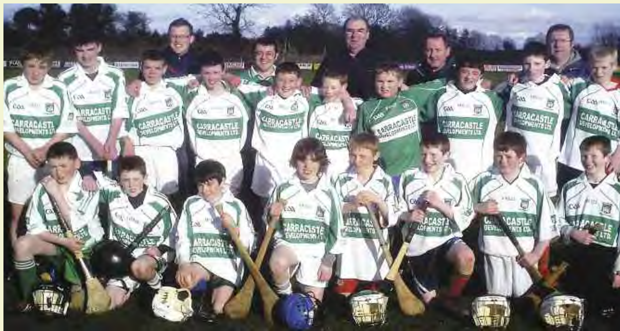
Above: The history making Caiseal Gaels U-14 hurling team who were beaten 2-3 to 2-0 by Tooreen in the clubs first game last Saturday in Tooreen.