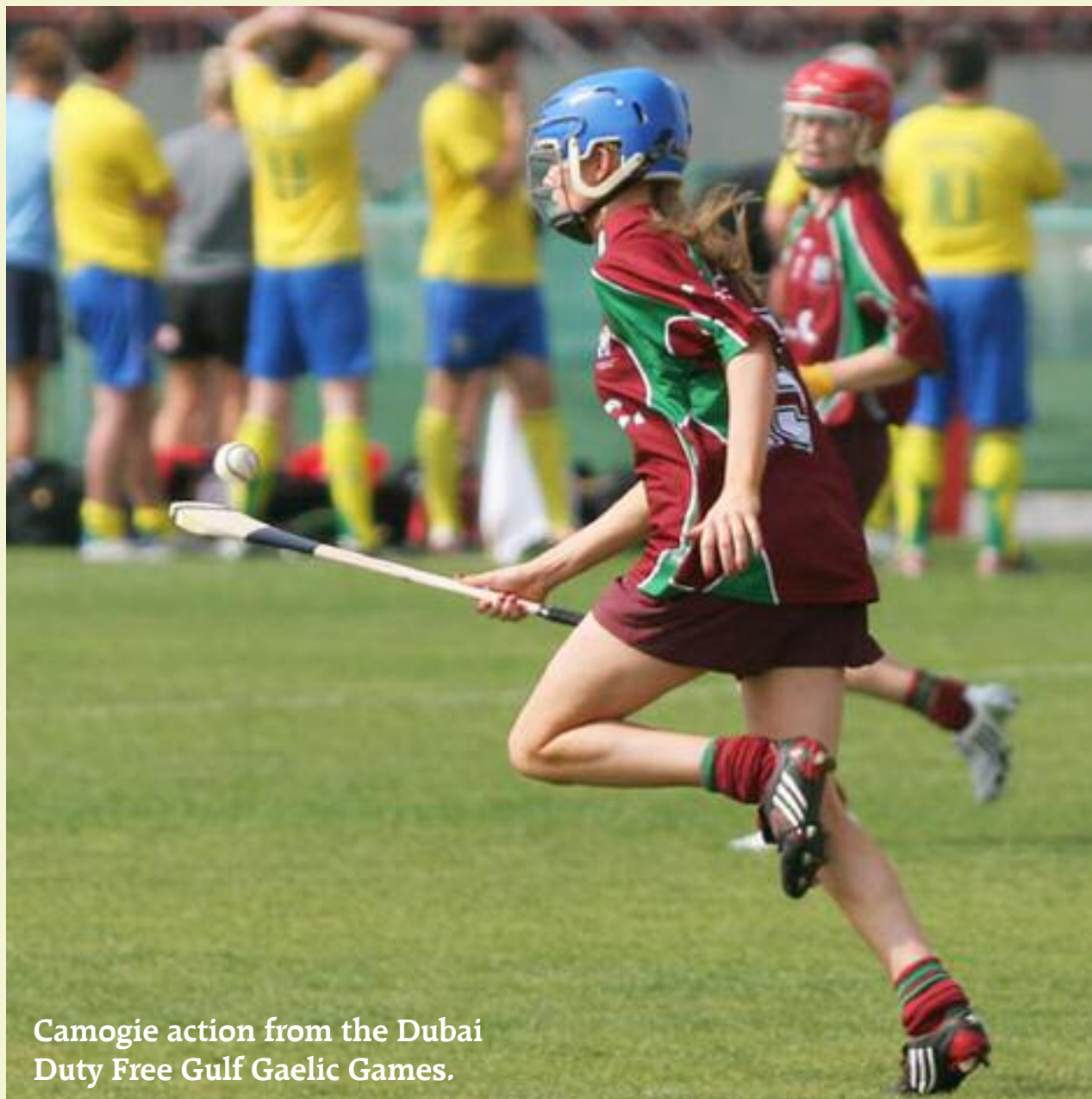
Camogie action from the Dubai Duty Free Gulf Gaelic Games.

This victory meant the hosts qualified for the shield final where they were pitted against the same opposition. The Cork side had learned valuable lessons from their defeat and managed to turn the screw in this second game winning by a narrow margin of two