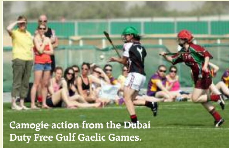
Camogie action from the Dubai Duty Free Gulf Gaelic Games.