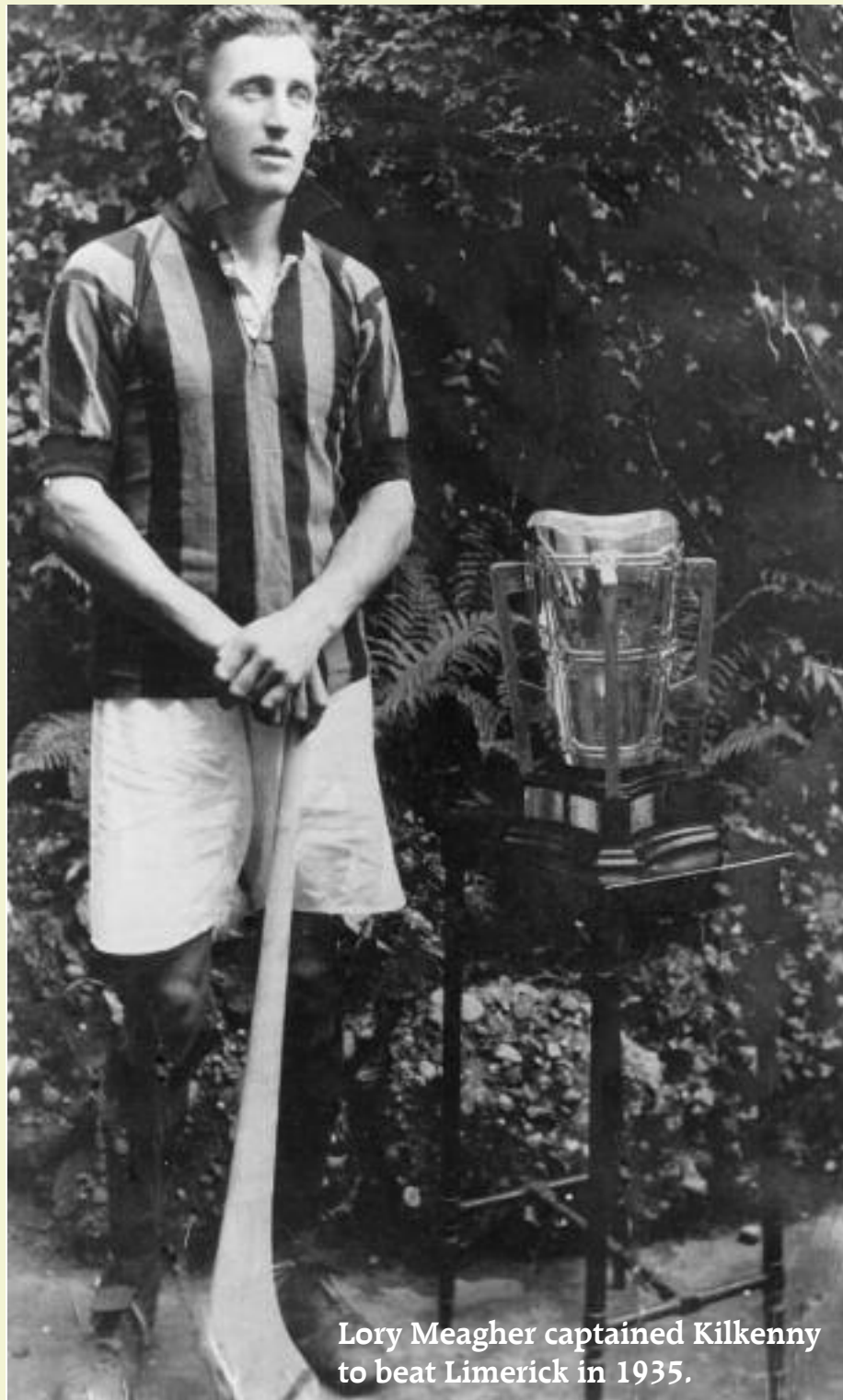
Lory Meagher captained Kilkenny to beat Limerick in 1935.