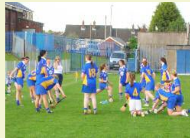
O Donovan Rossa Camogie team warm up for a home league game